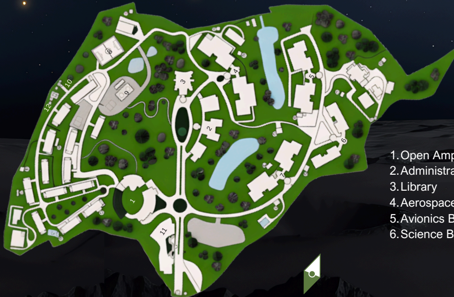
IIST Campus Map